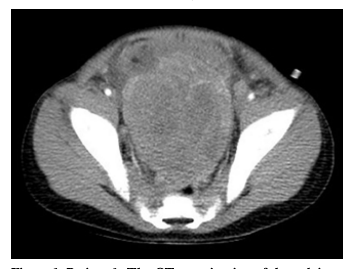
Figure 1. Patient 1: The CT examination of the pelvis at diagnosis. A solid-cystic pathological mass originating from prostate, measuring 73 \times 82 \times 130 mm, with heterogenous contrast enhancement.

A 2.5-year-old boy presented to the GP with lower abdominal pain and dysuria. No urinalysis was performed. The urine culture revealed Enterococcus faecalis UTI. Antibiotic therapy with amoxicillin and clavulanic acid led to a temporary improvement. After 6 weeks, the symptoms of UTI returned.