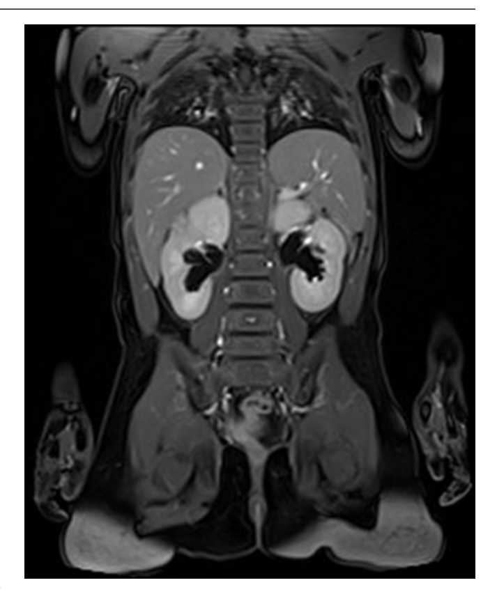
Figure 2. Patient 2: The MRI examination of the abdomen and pelvis at diagnosis. A T1-weighted coronal image showing bilateral hydronephrosis due to bladder tumor compressing ureteral orifices and internal urethral meatus.

The symptoms of B&P RMS in children may occur relatively early in the course of disease. However, they are often non-specific and include pain, dysuria and/or hematuria – a constellation of symptoms suggestive for UTI.<sup>7,8</sup> Moreover,